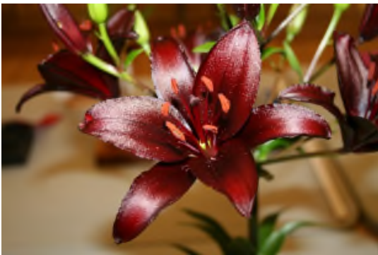
Class 4A winner of the Hybridizers award 2012. Fred's lilies always show well and everyone hoped that something like this ended up in the fall sale bags.