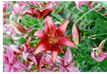
showing 2003 to 2005 hybridizing work.