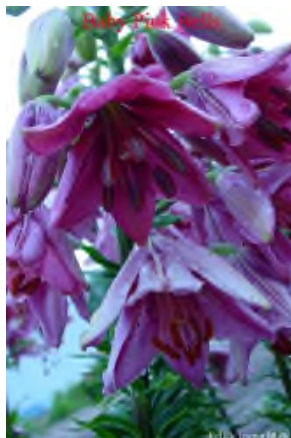
Baby Pink Bells was a unique hybrid as it never fully opened like a "normal" lily making it loved or hated by judges and growers.