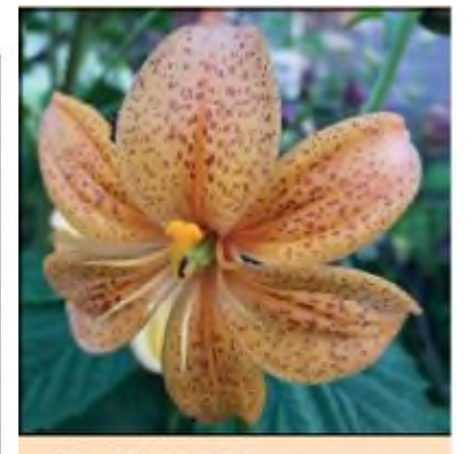
The AY-11-124 (Cross: 'Pink Taurade' x 'The Dark Knight') has distinctive flowers with superwide petals (10 cm) and outfacing orientation.