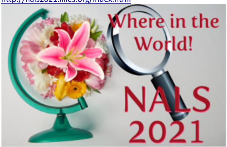
35<sup>th</sup> Annual Lily Show POSTPONED UNTIL 2021?